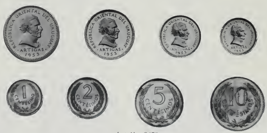
Lot No. 2478

2478 1953 Proof Set Struck in Gold. Comprises the 10, 5, 2, and 1 Centesimo. Identical to the currency issue, with bust of Artigas, although classified by KM as Patterns. KM Pn 46, 48, 49, 50. The Royal Mint reportedly struck 100 Sets in Gold for presentation. Light traces of handling, otherwise As Struck. Rare. 4 pieces. (1,750–2,000)